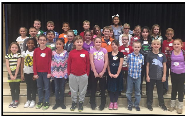
3rd Grade Spelling Bee Participants

We are looking forward to celebrating the outstanding achievements of our students.