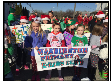
K-Kids participated in the Kiwanis Holiday Parade.